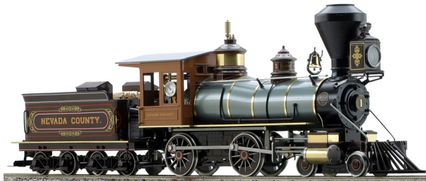
AC77-723 4-4-0 N.C.N.G. GRASS VALLEY #1