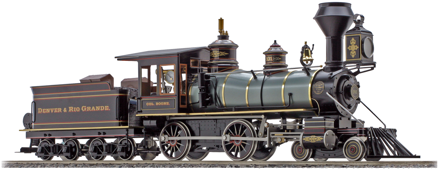
AC77-724 4-4-0 DENVER & RIO GRANDE COL BOONE #101

The 4-4-0 was a small sized inside frame locomotive that worked all over North and South America. They were Built in the 1870's and 1880's. The 4-4-0 shared many common parts with other similar sized locomotives of the same period. The three point suspension allowed these engines to go over fairly rough track without derailing, and also because of their large drivers move along at a good speed with a passenger train on level track. The classic 4-4-0 or American is the locomotive that most people think of when the old west was young. Hollywood correctly uses these preserved locomotives even today when needing trains of that period.